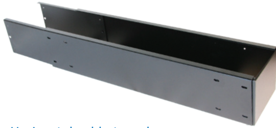
Horizontal cable trough (trough, joiner, and end cap - assembled)