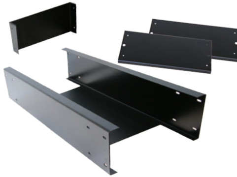
Horizontal cable trough - high density (trough, joiner and end cap)