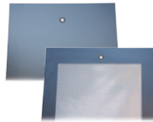
Cabinet Side Panels