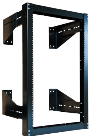
RFM-1920-RWF (Wall Mount Rack)

Standard color is black. Custom colors and sizes are available upon request