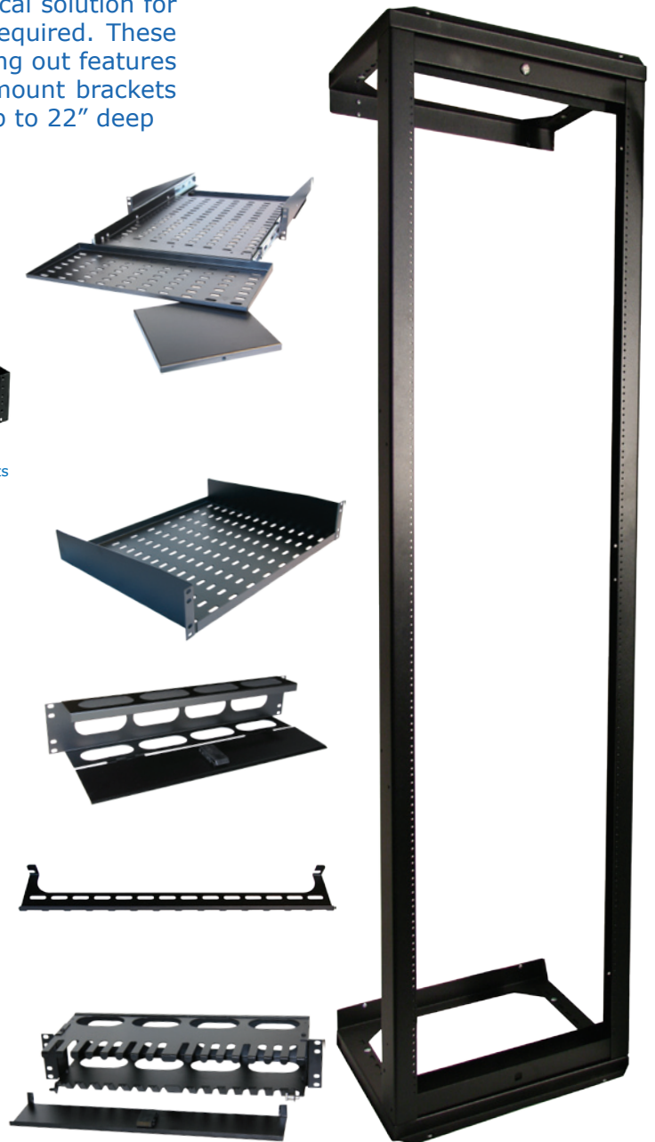
RFM-1944-RSO-ADJ (Wall Mount, swing out rack)