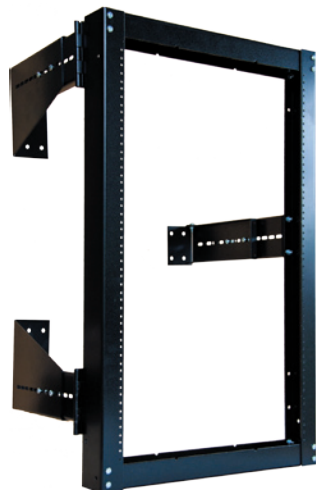
RFM-1920-RWS-ADJ ('Swing-Out' Wall Mount Rack)