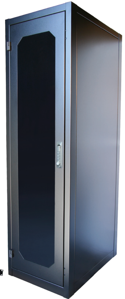
RFM-243683 secured, with 3-Point Latching, Smoked Acrylic front door, and solid side panels

Built around our standard R.F. Mote Frames, Seismic Cabinets are available Pre-Configured with our standard Mounting Rails, Cable Managers, Shelves, Power Bars, and Fans. A variety of seismic rated Doors & Side Panels are also available. To maintain seismic rating requirements, assembled units must be bolted to the floor and all doors are required to incorporate 3 point latching systems which c/w an integrated combination lock with key override. Seismic rated side panels are bolted onto the frame internally. For security purposes, the bolts cannot be removed from outside the cabinet.