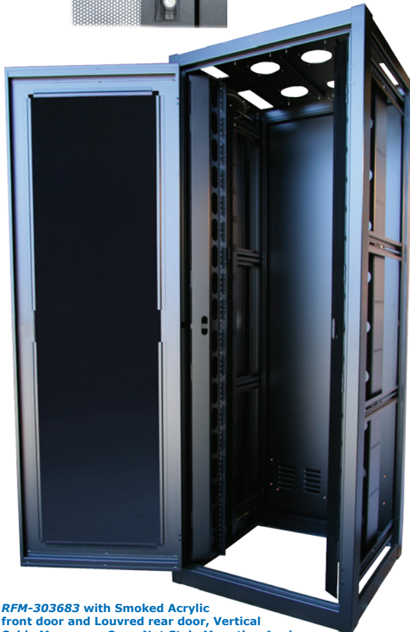
RFM-303683 with Smoked Acrylic front door and Louvred rear door, Vertical Cable Managers, Cage-Nut Style Mounting Angles