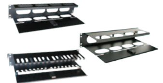
Horizontal Cable Management