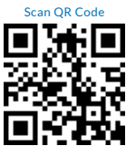
Scan QR Code