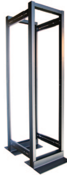
Four Post Rack Bracket Kit