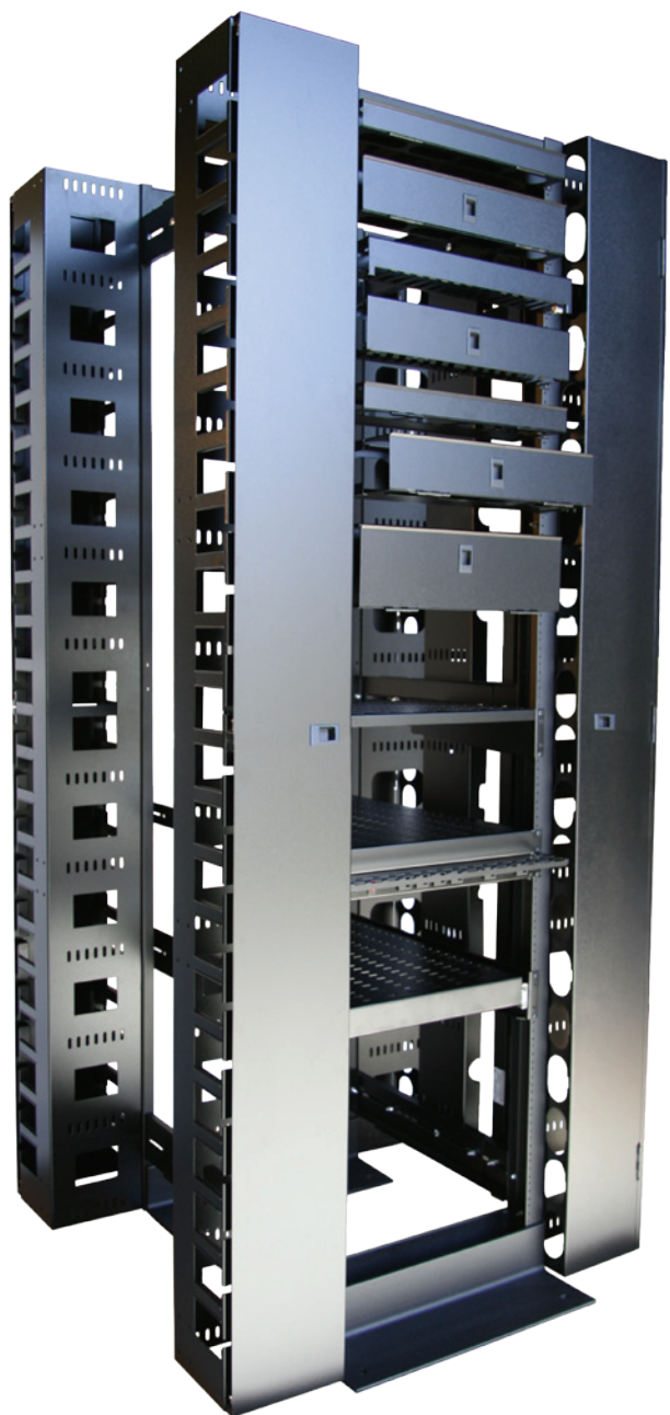
RFM-FPRK (various Cable Management and Shelving options also shown)

The Modular Design of the Four Post Rack System allows for easy expansion to suit ever changing network needs. With future expansion in mind, units may be added with ease.